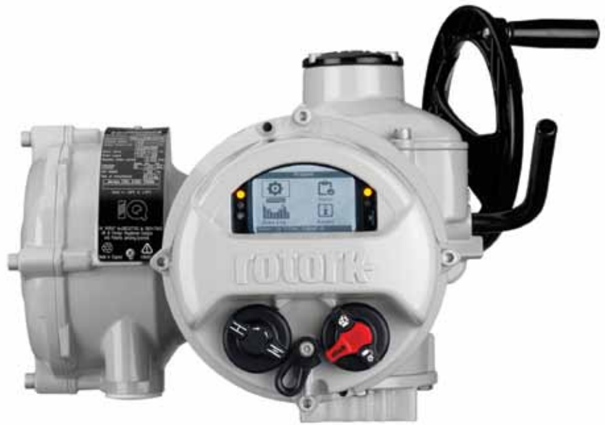
The actuator local position indicator window has been transformed into a window into the plant process

Valve control relies on accurate, repeatable and reliable position