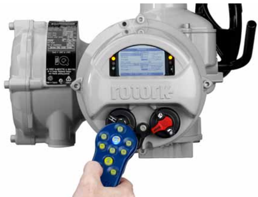
Wireless two-way communication using the non-intrusive hand held setting tool is one of the secure means of accessing the asset management data in Rotork actuators

resolution required. In simple terms, larger valves or control valves required more complex encoders with more gearing, more sensors and therefore more single point failure modes. Using the latest technology and after several years of testing, the IQ absolute encoder overcomes these problems. It is contactless, with only four moving parts and can measure up to 8000 output turns with high resolution, redundancy and self-checking. Unlike existing absolute encoders, this design increases position sensing reliability whilst providing power off position measurement.