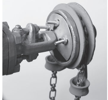
CL4 back view