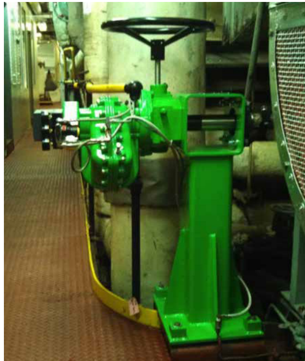
Installed Type K damper drive unit.